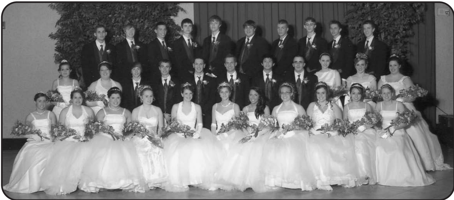
Eighteen 2008 PRCUA Michigan Dance School graduates and their escorts

The 17th Annual PRCUA Michigan State Ball honored and presented to family, friends and Polonia, eighteen graduating seniors. The annual event was held at the extravagant Crystal Gardens Ballroom, in Southgate, MI.