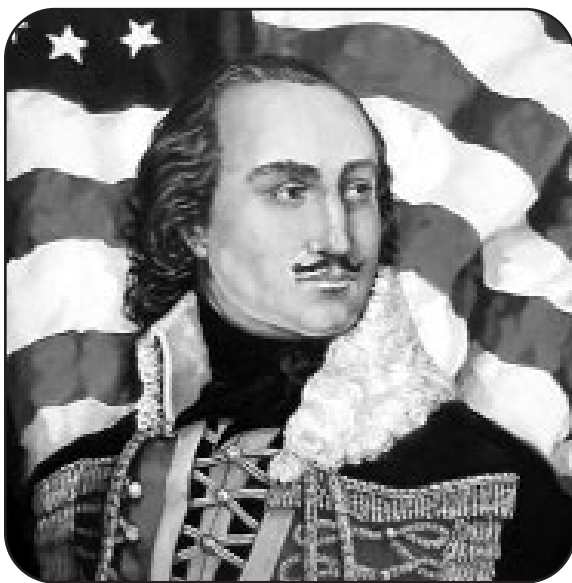
General Casimir Pulaski (1748-1779) Father of the American Cavalry