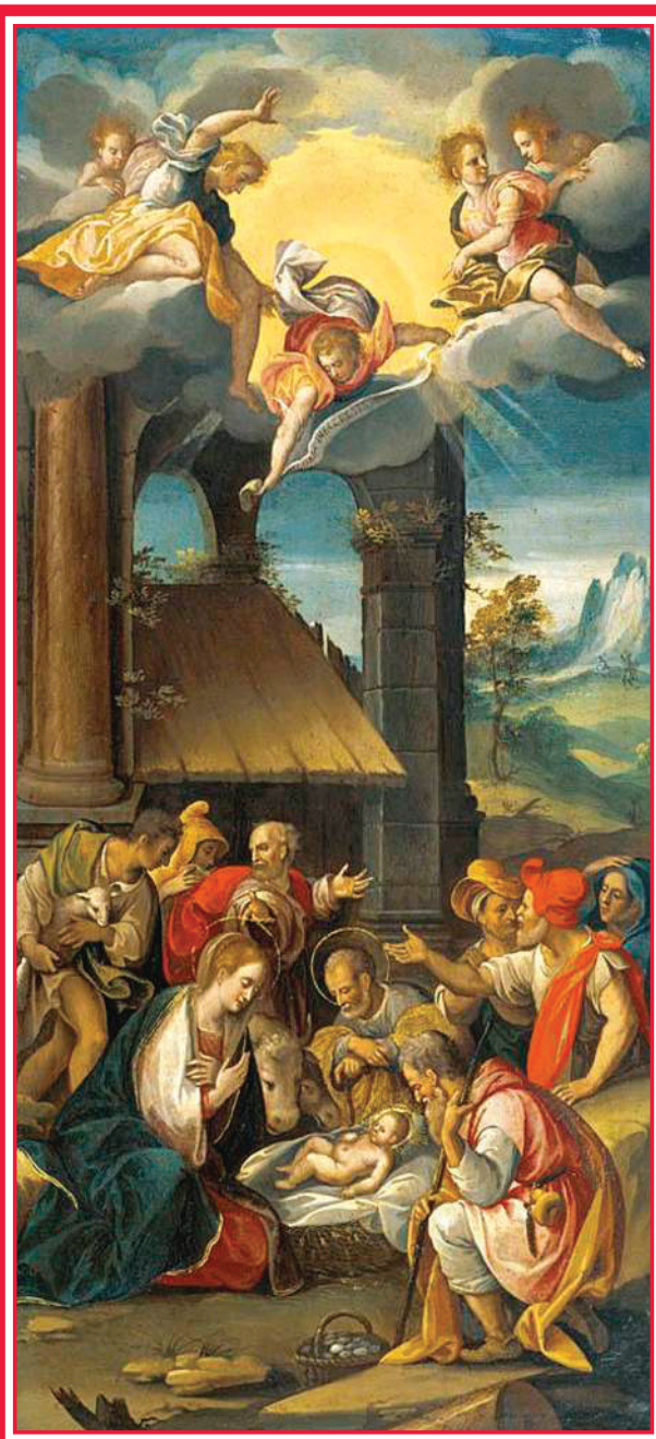
The Adoration of the Shepherds by Prospero Fontana

It is a miracle, too, that Joseph believes Mary. A man, even a man in love, finds it hard to understand how his fiancée can be with child. Jealous creatures, men are inclined to believe the worst. But Joseph, too, is visited by an angel who tells him that the boy will be called Jesus, for He will save his people from their sins. Joseph's trust