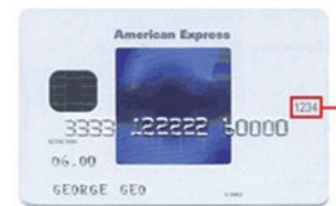
4 Digit Card Verification Number

For your piece of mind, the PRCUA undergoes annual Payment Card Industry Data Security Standard (PCI DSS) certification. We will responsibly process and protect the information that you provide on this form according to the PCI DSS standards.