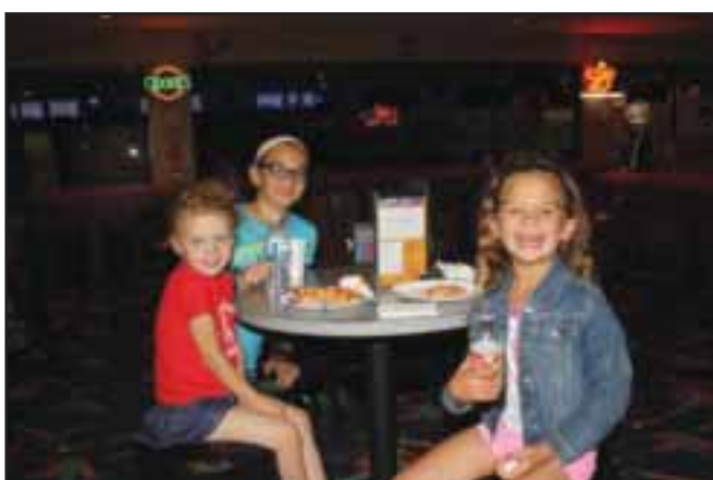
Participants enjoying pizza and pop after bowling