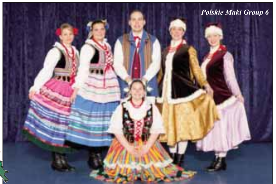
Polskie Maki Group 6