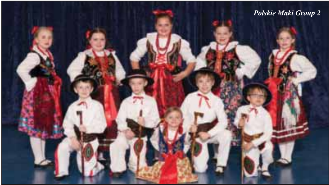
Polskie Maki Group 2