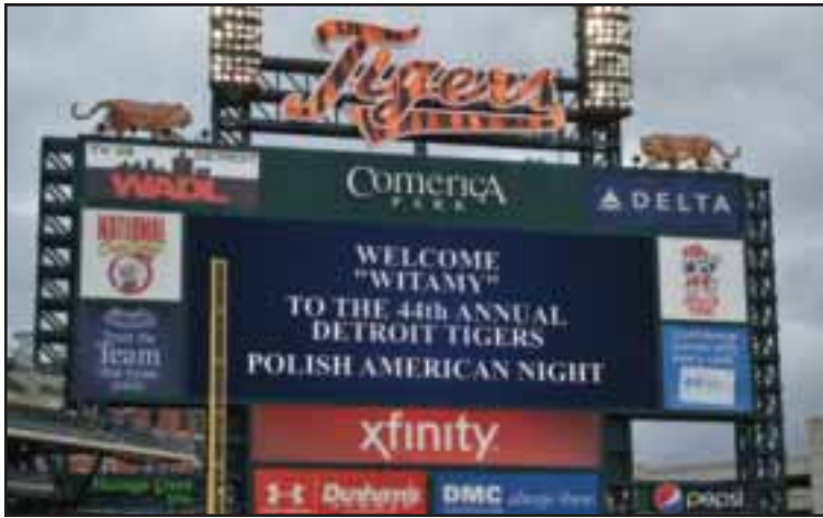
Sign welcoming everyone to Polish American Night at Comerica Park

DETROIT, MI - The 44th Detroit Tigers Polish American Night was held on Friday, June 13, 2014. This annual event was successfully coordinated by PRCUA #1593 St. John Paul II Society. The air was chilly but an air of excitement permeated Comerica Park. Gates opened at 5:00 p.m. with Polka bands playing lively Polka music throughout the stadium until game time.