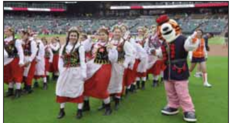
Polish folk dancers with Paws -the Tigers' mascot

of 39,811. Unfortunately, the Tigers lost but the performers and dignitaries enjoyed being on the field and taking part in this community event. The evening ended with a beautiful fireworks display. The year 2015 will be a special year marking the 45th Annual Polish American Night. Mark your calendar!