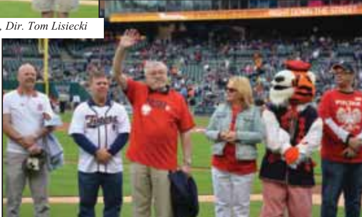
Pol-Am dignitaries with Paws