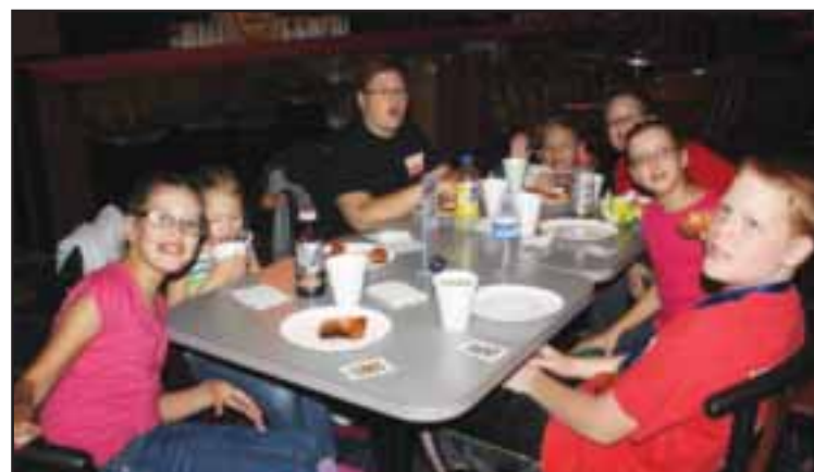
Happy bowlers waiting for their lunch of pizza and pop