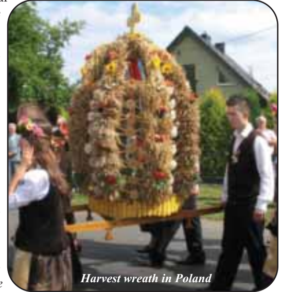
Harvest wreath in Poland