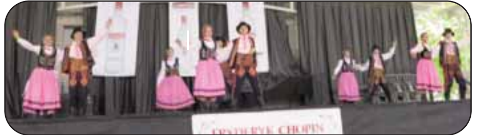
ZPiT "Wesoły Lud"