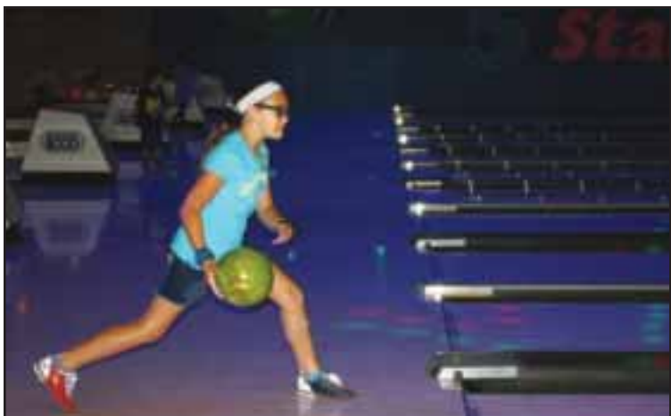
One of the participants lining up that bowling ball just right