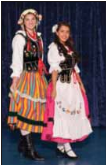
Polskie Maki Group 5

In addition to performing a two-part program of national and regional dances of Poland, The Polskie Maki dancers presented a novelty program entitled, "Born To Dance." What a thrill it was for our dancers to don exciting and colorful costumes representing all styles of American dance from Broadway's 42nd Street, Shirley Temple's Goodship Lollipop and When I Grow Up, a Latin American Tico Tico, and Italian Tarentella, Video Dancers and Rock 'n Rollers.