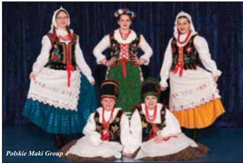
Polskie Maki Group 4

Plenty of awards were presented at the conclusion of the recital to the deserving Polskie Maki dancers: Certificates of Participation, Perfect Attendance, Outstanding Attendance, Perfect Performance, Outstanding Performance, Participation Awards, as well as Service Awards for three, five, seven, and ten years were presented.