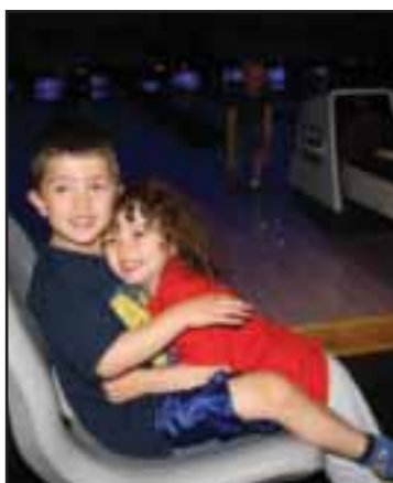
It's always time for a hug!