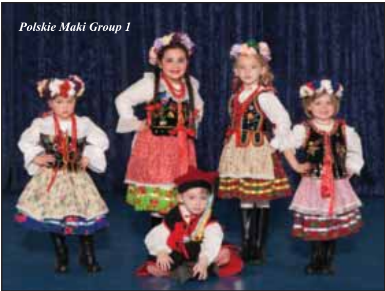
Polskie Maki Group 1