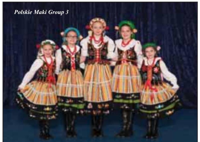
Polskie Maki Group 3