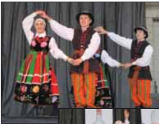
Wesoly Lud Polish Folk Dance Company from Chicago, IL