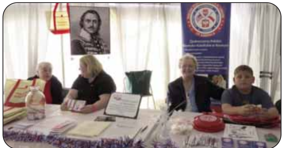
Stoisko ZPRKA na Festiwalu Polskim