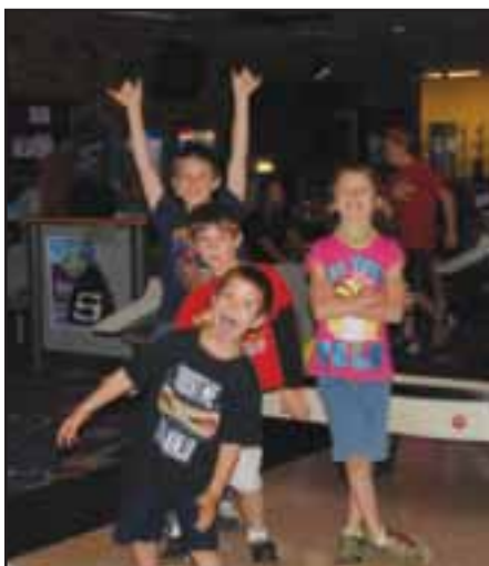
PRCUA kids being silly and having fun!