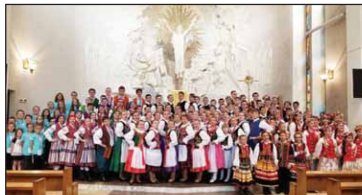
PRCUA dance groups after Mass at the church in Iwonicz Zdrój

including parents): 145 - reminiscent of PRCUA's 145th Anniversary! News and reflections from the Iwonicz Zdrój Festival will be featured in the upcoming issues of Naród Polski and posted on the PRCUA website.