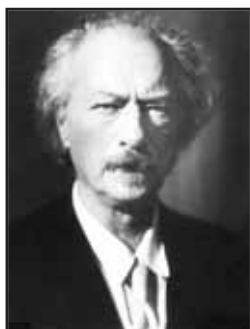
Ignacy Jan Paderewski

nevertheless would probably have been far worse off without Piłsudski's forceful, albeit often-controversial leadership.