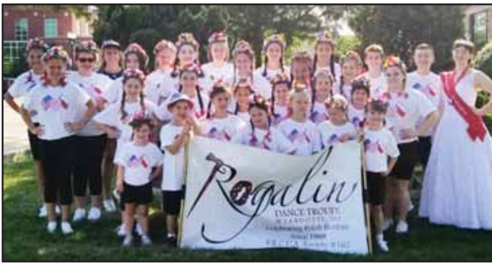
Rogalin at the 4th of July celebration