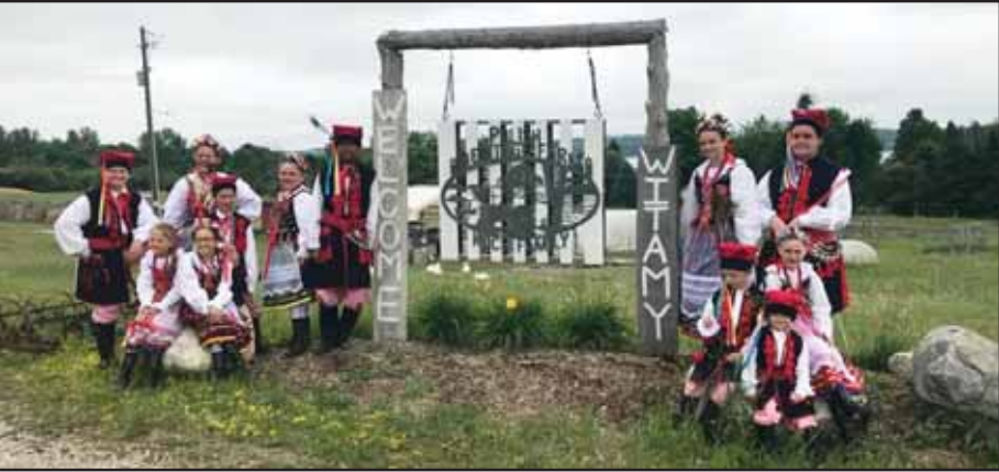
Gwiazda Dancers at Polish Heritage Farms