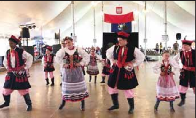
Gwiazda performing at Cedar Polka Fest