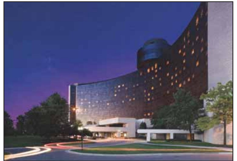
Edward Hotel & Convention Center in Dearborn, MI

The Convention provides a valuable opportunity for members to come together as delegates to continue the work of our fraternal organization and to learn about the important changes and plans that will affect the Union on both local and national levels. The election of a new governing body of the PRCUA will take place. These leaders will be tasked with guiding and planning for the future of the PRCUA. May our Patron, the Sacred Heart of Jesus, bless the delegates and their deliberations.