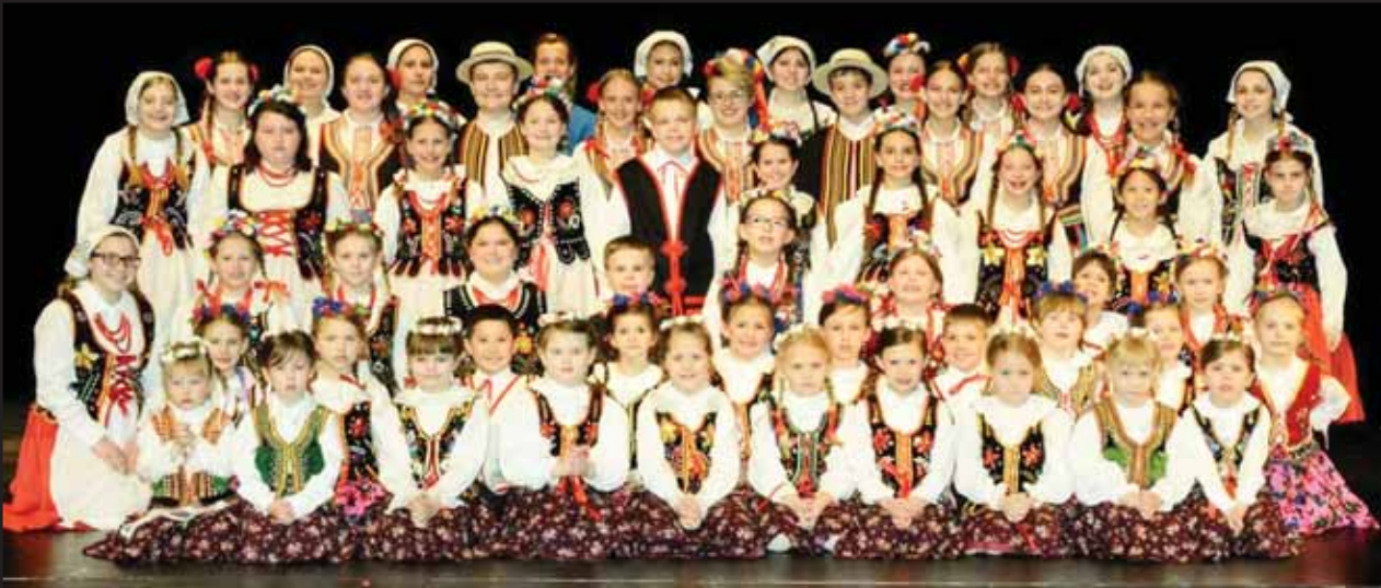
Rogalin Dance Troupe Recital