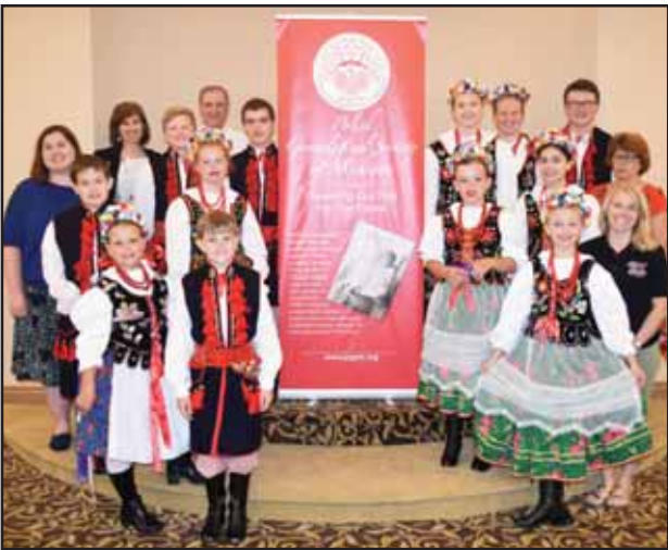
Zajączek Ensemble with Polish Genealogical Society of Michigan banner