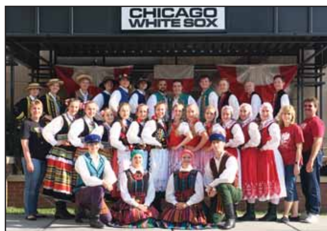
Wesoły Lud na stadionie Guaranteed Rate Field

Niektórzy z naszych członków wzięli udział w paradzie, która odbyła się przed meczem, zaś wszyscy gorąco oklaskiwali tancerzy zespołu „Wesoły Lud”, którzy wystąpili przed meczem przy bramie wejściowej oraz na płycie boiska.