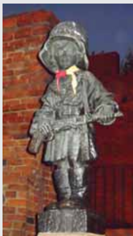
Pomnik Małego Powstańcy na Starym Mieście w Warszawie

W czasie powstania zniszczeniu uległo 25% zabudowy lewobrzeżnej Warszawy. Ogólnie, na skutek oblężenia we wrześniu 1939 r., powstania warszawskiego i zagłady warszawskiego getta, zniszczeniu uległo 84% zabudowy lewobrzeżnej Warszawy.