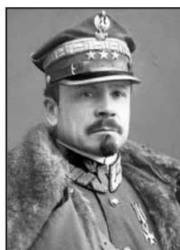
Gen. Jozef Haller